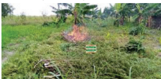
How many times do I have to say

As it stands right now hundreds of farmers currently cultivating marijuana illegally are eagerly awaiting the Legislative Instrument to be approved by Parliament. Once this takes place it will open the floodgates for these same farmers to begin a new chapter in their lives by cultivating Cannabis Sativa L (Industrial Hemp) legitimately. They will no longer be looking over their shoulder and worrying about the pending knock at their door. What's more, they will be contributing to the country's gross domestic product through the paying of taxes every time they cultivate.